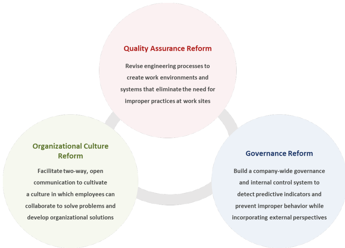
Overview of the Three Key Reforms

In collaboration with the company-wide transformation project, Mitsubishi Electric will make every effort to transform itself towards creating a new Mitsubishi Electric by enhancing and developing the Three Key Reforms of quality assurance, organizational culture, and governance.