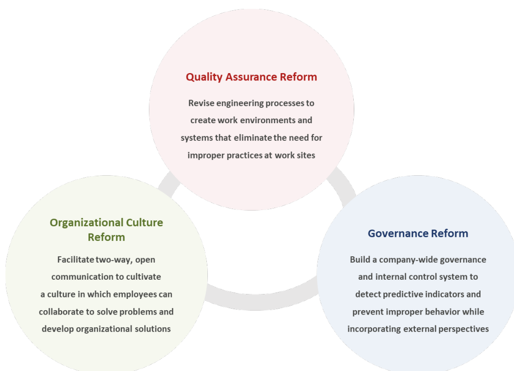
Overview of the Three Key Reforms

In collaboration with the company-wide transformation project, Mitsubishi Electric will make every effort to transform itself towards creating a new Mitsubishi Electric by enhancing and developing the Three Key Reforms of quality assurance, organizational culture, and governance.