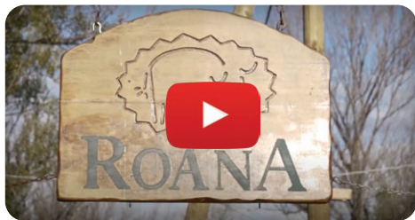
Roana Zootechnical farm is in the countryside of Latina, Italy, and is home to approximately 1100 water buffalos. www.youtube.com/watch?v=PS7lWVpIEIY

The control of critical process parameters, such as temperature, gas pressure, in-feed rates and mixing within the digester, plays a crucial role in maximizing both the volume of methane produced and its purity. The sensitivity of the system and its coordination can make the difference between it being profitable or not, so responsive automation and network communications are vital to the commercial success of the project.