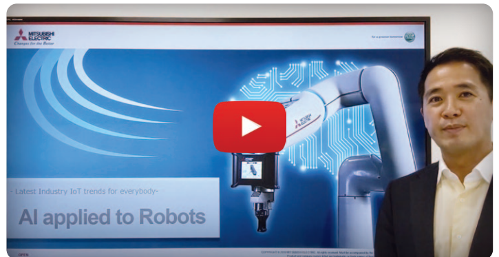
Learn more about industrial IoT through Webinars on the Mitsubishi Electric FA channel at: Latest Industry IoT trends for everybody ( https://bit.ly/32Nsf1R )

Mitsubishi Electric Factory Automation Systems Group offers a vast range of automation and processing technologies that help bring higher productivity and quality to the factory floor. e-F@ctory is Mitsubishi Electric’s integrated concept to build reliable and flexible manufacturing systems that enable users to achieve many of their high speed, information driven manufacturing aspirations. ■