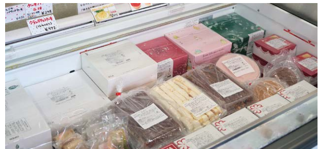
Confectionery sold under the Famiel Confectionery brand is available at the shop "Cake Mania" next to the factory.

on visualizing power consumption by installing Mitsubishi Electric's "EcoMonitor" energy measurement units on ovens and other key equipment.