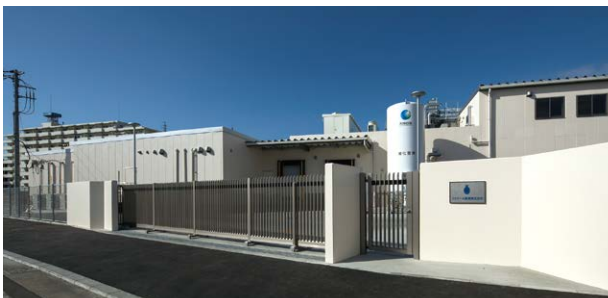
In 2017, the company moved to Yokosuka, Kanagawa Prefecture, where the current headquarter factory is located.

Founded in 1976 as a commercial frozen cake manufacturer based in Yokohama, Japan, Famiel Confectionery manufactures and sells cakes and other western confectionery. In addition to cakes sold under its own brand, the company makes a variety of frozen cakes at its factory and sells them to hotels and restaurants nationwide in Japan. In 2017, the company moved to Yokosuka, a city within the same Kanagawa Prefecture, where the current headquarter factory is located and became the hub of its business expansion.