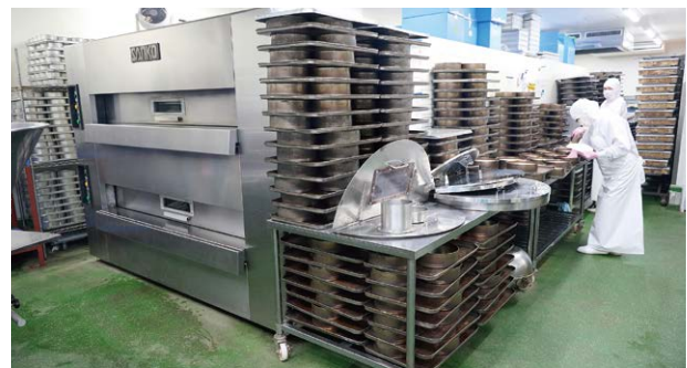
In the cake manufacturing process, ovens that bake cakes consume a large amount of electricity.

"When we visualized our energy consumption, I was able to understand a lot of things. It was not only about how much electricity the ovens were using, but I also learned that the machine we use to wrap the cake in film did not use as much electricity as I originally thought it would. When such data was made available to the factory floor, it attracted the interest of our workers and made them think about how they could save more energy.," says Hideyuki Moriya. Therefore, when Famiel moved their factory to the current location in 2017, they not only reinstalled the visualization system, but also expanded the number of items they measured the energy use on. They also utilized "EcoWebServerIII", an energy saving data collection server, and introduced energy demand monitoring and management throughout the factory.