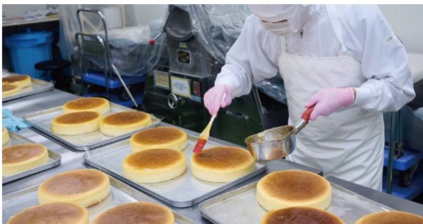
Famiel Confectionery sells a variety of cakes to hotels and restaurants nationwide in Japan. The photo above shows the process of spreading jam on baked cheesecakes.

Founded in 1976 as a commercial frozen cake manufacturer based in Yokohama, Japan, Famiel Confectionery manufactures and sells cakes and other western confectionery. In addition to cakes sold under its own brand, the company makes a variety of frozen cakes at its factory and sells them to hotels and restaurants nationwide in Japan. In 2017, the company moved to Yokosuka, a city within the same Kanagawa Prefecture, where the current headquarter factory is located and became the hub of its business expansion.