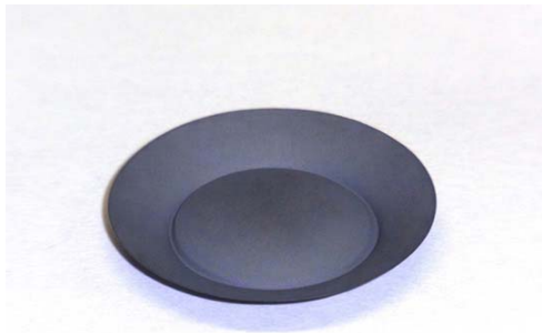
Boron-carbide diaphragm made with Mitsubishi Electric's new technologies

TOKYO, December 9, 2014 – Mitsubishi Electric Corporation (TOKYO: 6503) announced today it has developed an advanced technology for manufacturing boron-carbide diaphragms used in hi-fi loudspeakers, applying an optimal diaphragm build-up method to realize the fastest sound speed of any commercially available boron-carbide diaphragm, resulting in improved sound quality. Mitsubishi Electric will apply its new technology in home and automotive acoustic products and audiovisual systems.