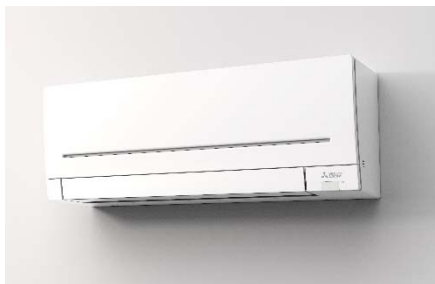
MSZ-AP series room air conditioner