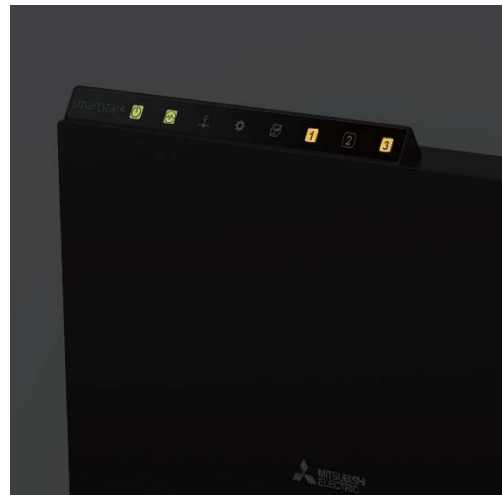
Rendering 4: Backlit pictogram display