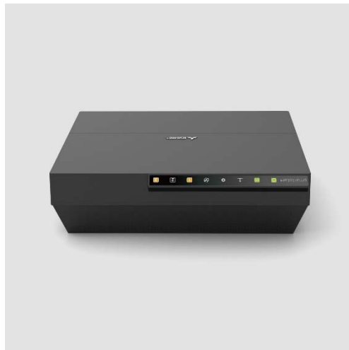
Rendering 3: horizontal mounting on a rack