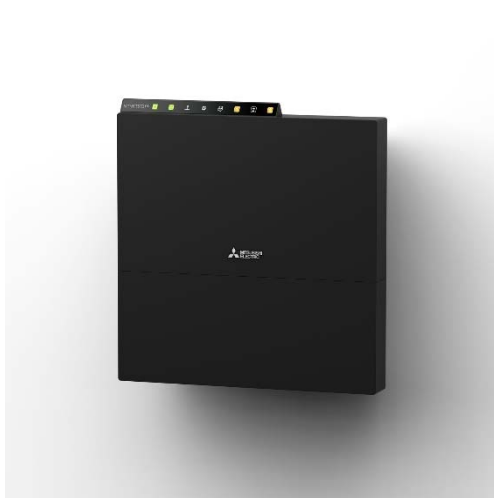
Rendering 1: wall-mounted installation