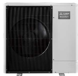
Ecodan PUAZ-AA series air-to-water heat pump outdoor unit