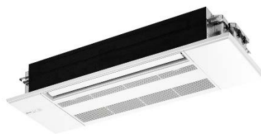
MLZ-KP/MLZ-RX/MLZ-GX/MLZ-HX unidirectional ceiling-mounted cassette-type air conditioner series