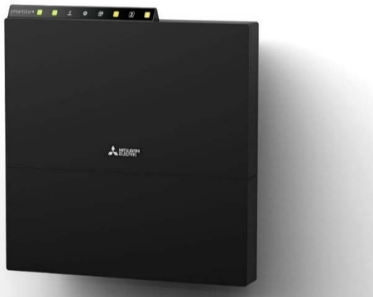
Mitsubishi Communication Gateway XS-5R/XS-5T environment-resistant IoT communication gateway

Three other Mitsubishi Electric products also won international Product Design 2018 awards: the MSZ-AP series room air conditioner, the MLZ-KP/MLZ-RX/MLZ-GX/MLZ-HX unidirectional ceiling-mounted cassette-type air conditioner series, and the Ecodan PUAH-AA series air-to-water heat pump outdoor unit.